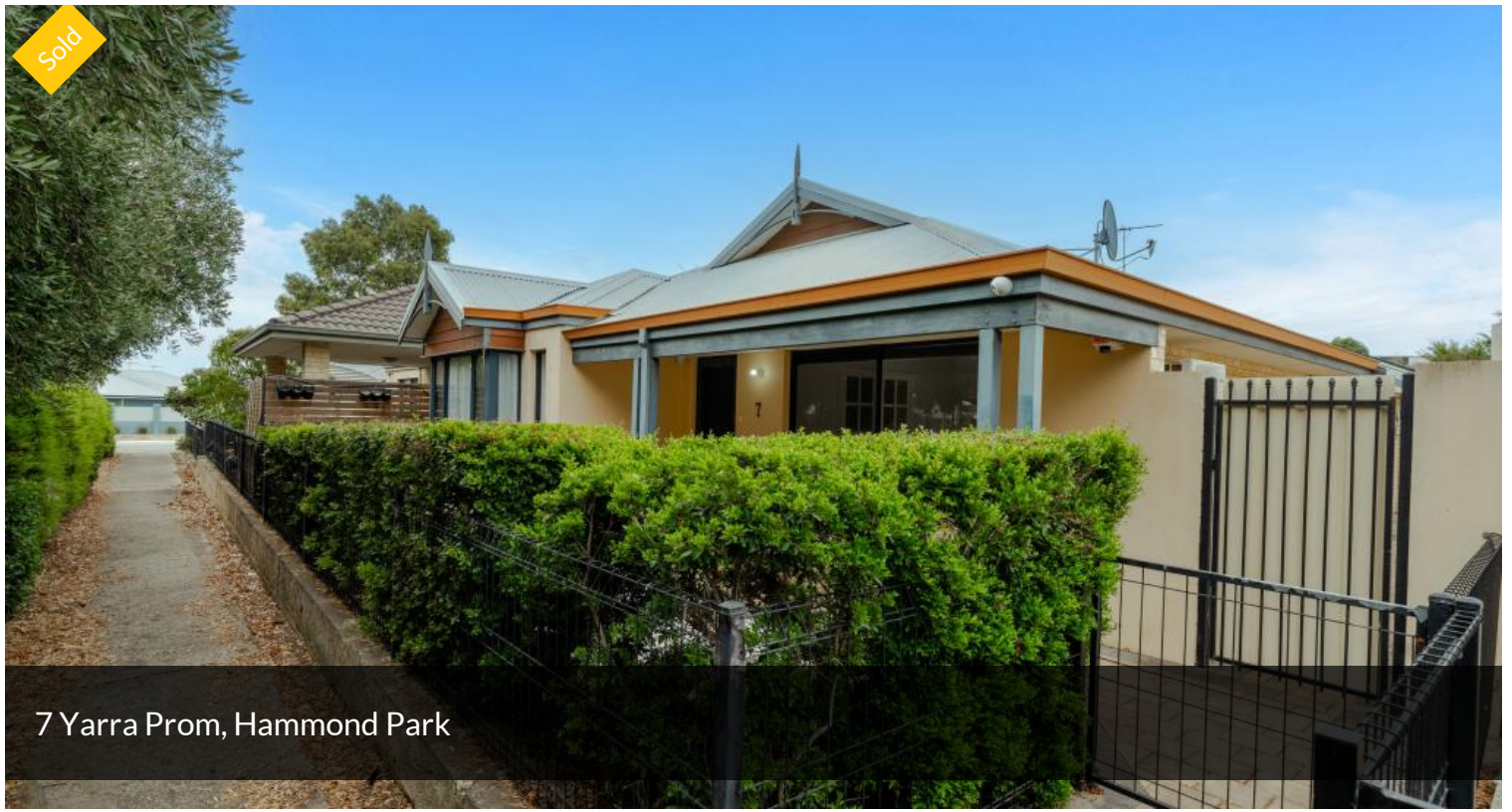
7 Yarra Prom, Hammond Park